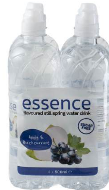
Apple & Blackcurrant 500ml x 4 multipack