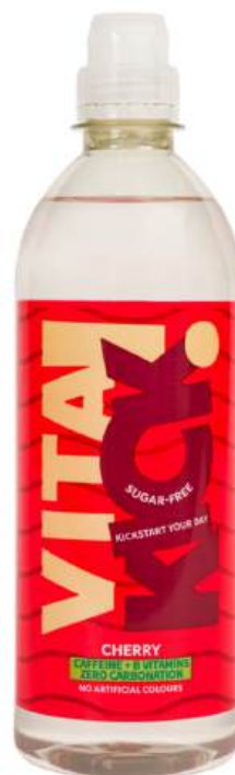
VitaKick Cherry 500ml

12 months. Store out of direct sunlight.