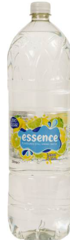
Lemon & Lime 2000ml