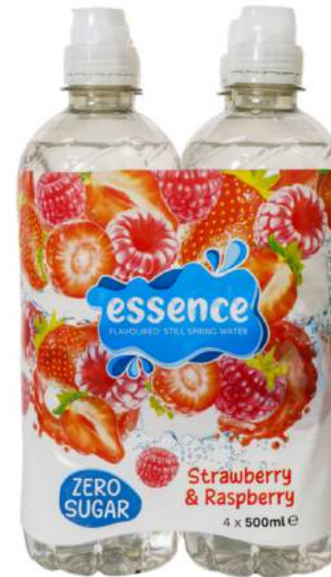
Strawberry & Raspberry 500ml x 4 multipack