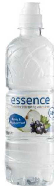
Apple & Blackcurrant 500ml

12 months. Store out of direct sunlight.