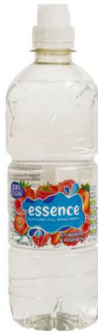
Strawberry & Raspberry 500ml

12 months. Store out of direct sunlight.