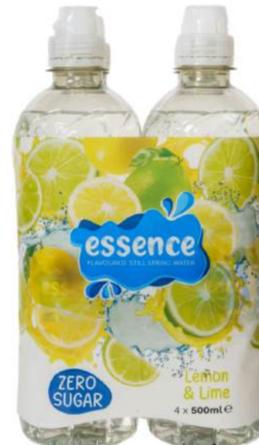
Lemon & Lime 500ml x 4 multipack