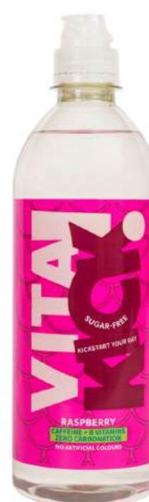
VitaKick Raspberry 500ml