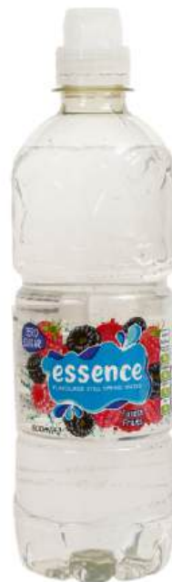
Forest Fruits 500ml

12 months. Store out of direct sunlight.