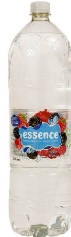
Forest Fruits 2000ml