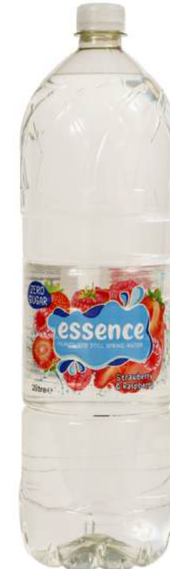
Strawberry & Raspberry 2000ml