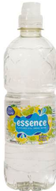
Lemon & Lime 500ml

12 months. Store out of direct sunlight.