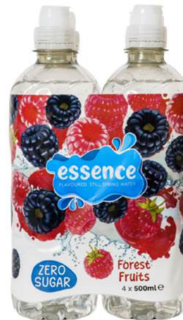
Forest Fruits 500ml x 4 multipack